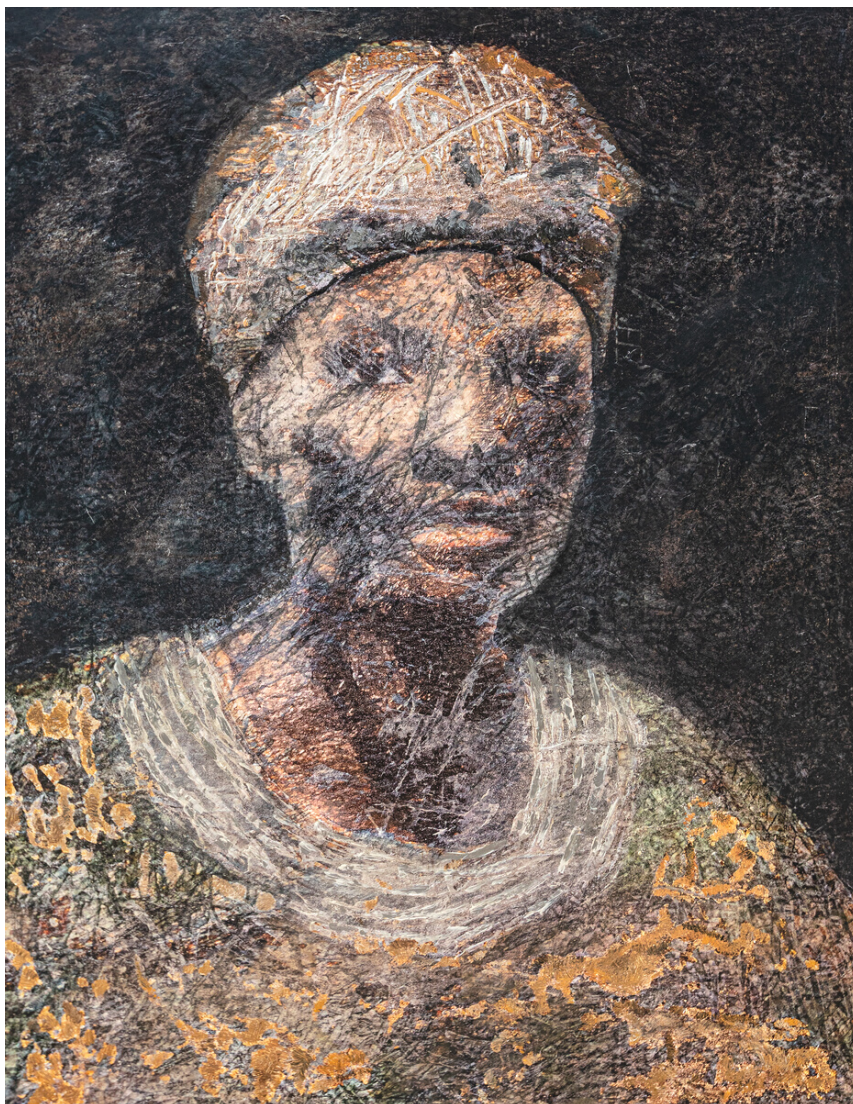
1/1 | Acrylic and ink on metal | 120x150cm