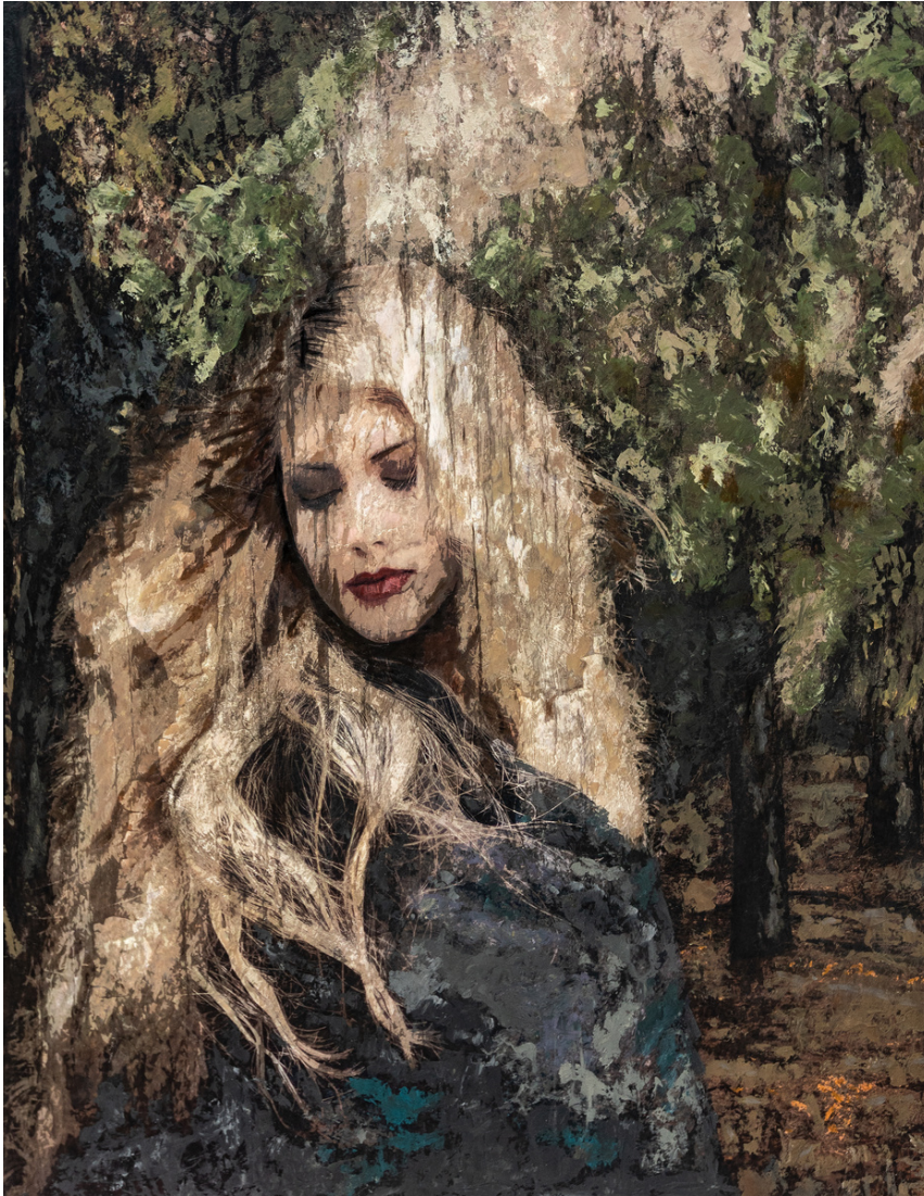
1/1 | Acrylic and ink on metal | 120x150cm