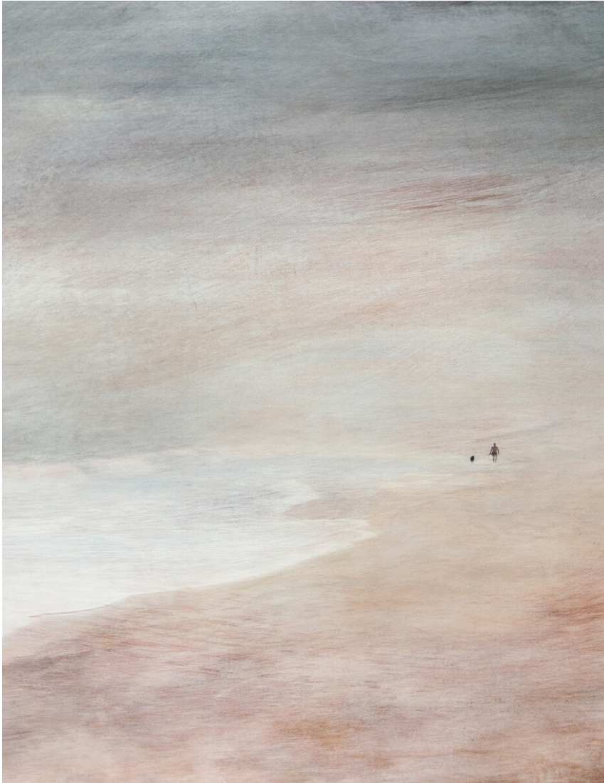
Ink, oil and acrylic on canvas | 180x150cm | Edition [3]